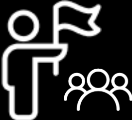
Individual Led Activities